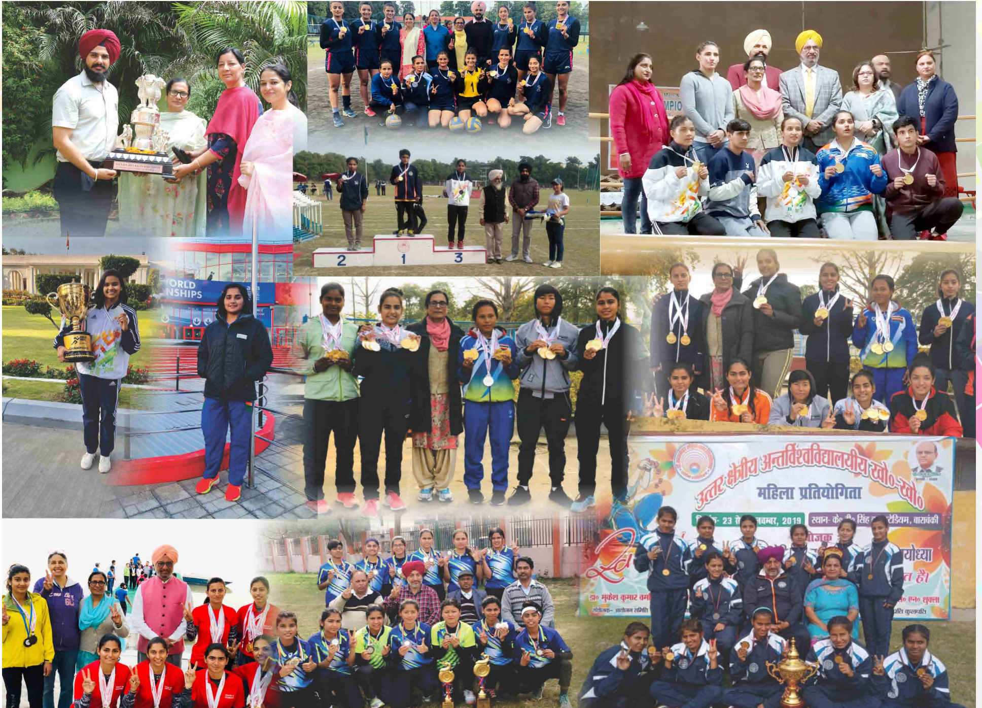
Teams of Guru Gobind Singh College for Women clinched many Winner's Trophies